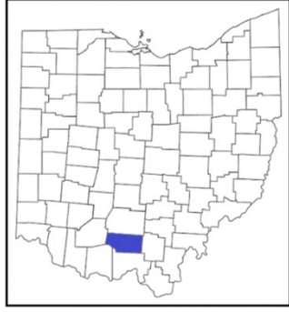
Figure 1. Pike County